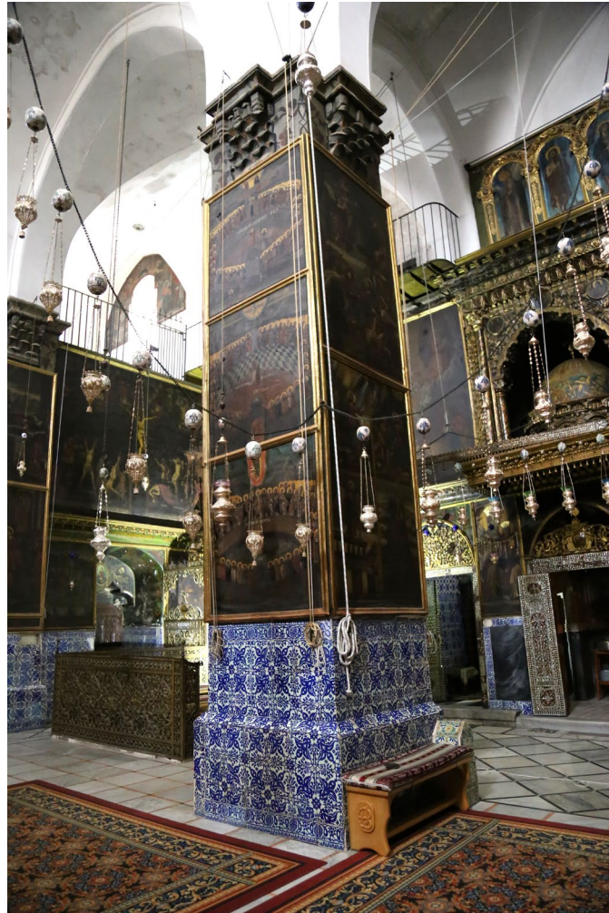
Figure 1: The massive column facing the Chapel of the Martyrdom of St. James the Great, northwestern view, Sts. James Cathedral, Jerusalem.