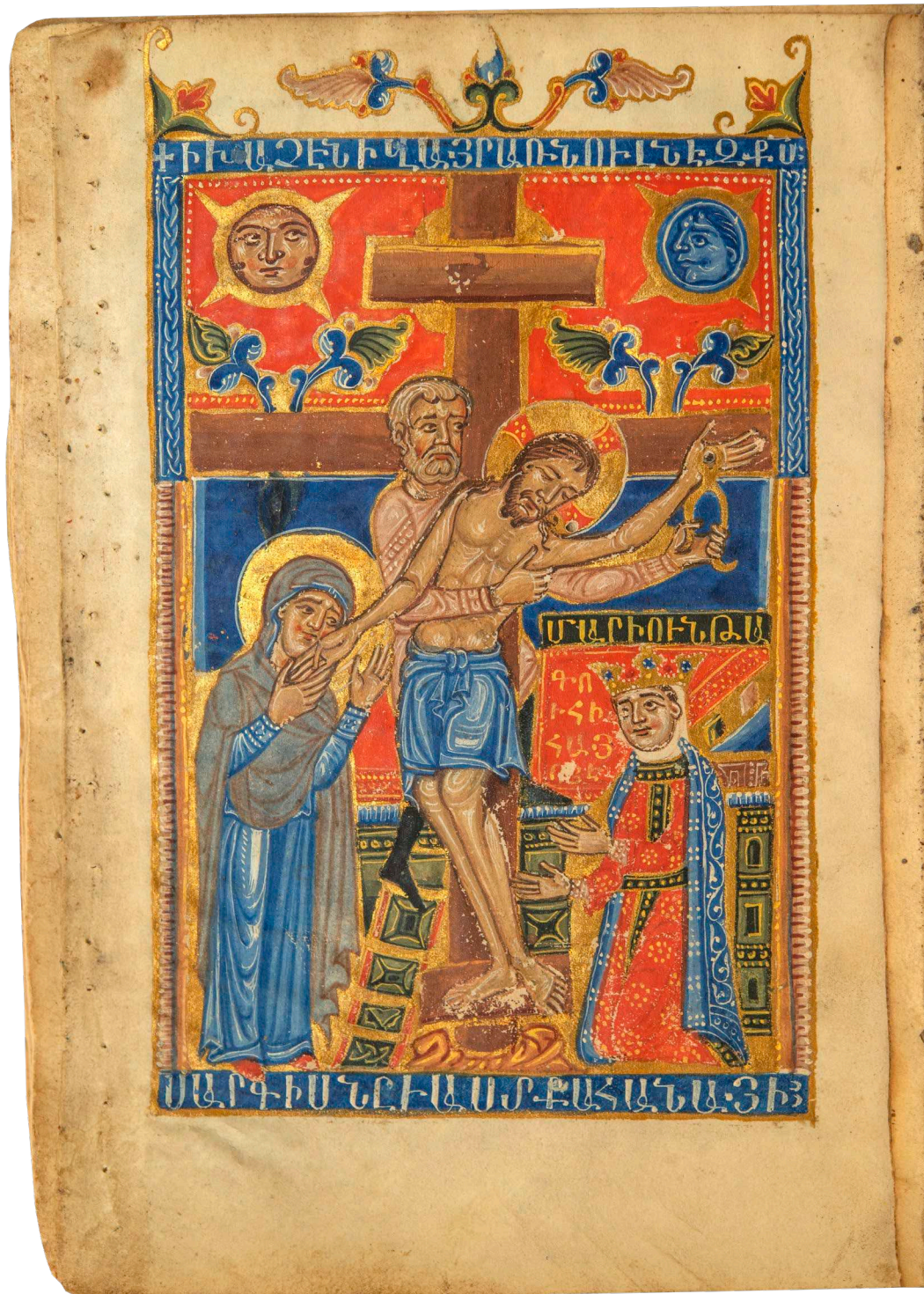
Figure 6: Gospel of Queen Mariun (1346 CE), Armenian Patriarchate of Jerusalem, manuscript J1973, fol. 258v.