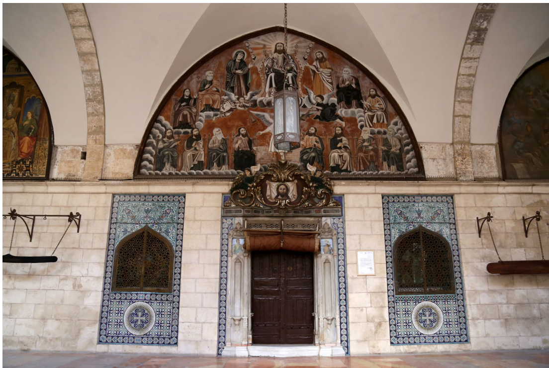
Figure 3: The modern principal entrance of Sts. James Cathedral, flanked on both sides by closet-like altars dedicated to St. George and to St. Nicholas the Wonderworker.

This pre-restoration description of the main entrance by Xorēn Mxit'arean, a scholar of the Sts. James congregation, appears to correspond entirely with the modern appearance of the cathedral's main entrance, with its depiction of the Last Judgment in the upper part and with the two closet-like altars dedicated to St. George and St. Nicholas, respectively (Fig. 3). These closet-altars are still in use for occasional ceremonies. As for the tombstones mentioned by Mxit'arean, apparently they were later moved out of the gavit' or around it, as was the case with Patriarch Abraham's tombstone (Fig. 2). Although several written and oral traditions—some of which date back centuries—regarding Queen Mariun's final resting place seem to corroborate each other, only serious archaeological research will help us achieve any level of certainty on this and many other issues related to the multilayered history of the Sts. James Cathedral.