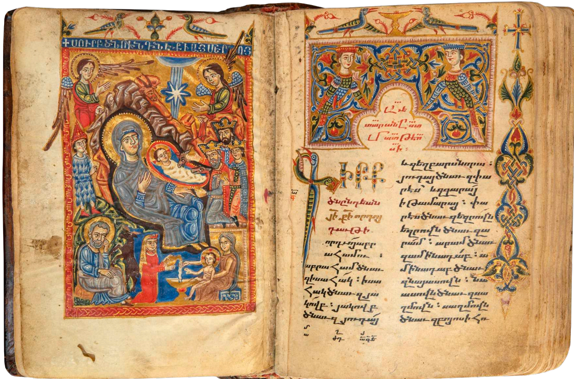
Figure 4: Gospel of Queen Mariun (1346 CE), Armenian Patriarchate of Jerusalem, manuscript J1973, fols. 8v–9r.

Several art-historical studies have identified these images as representing Mariun’s daughter “Princess Fimi.” 81 It turns out, however, that this identification is based on a false reading of the colophon of the Gospel of Queen Mariun , which requires closer consideration. Before we turn to the relevant passages of that colophon, some remarks must be made to clarify the reason for the abovementioned confusion.