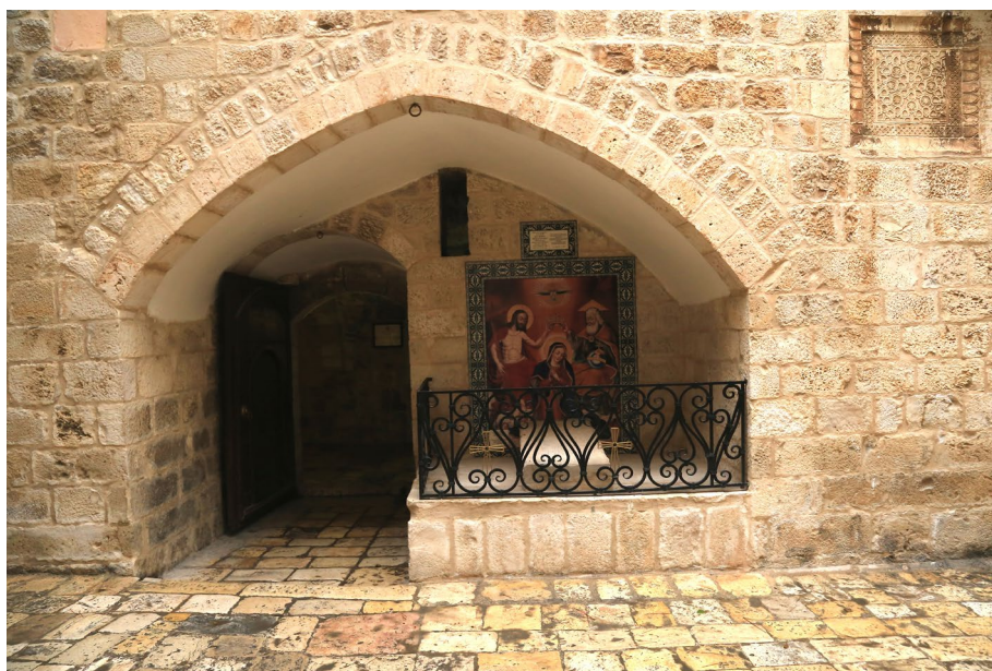
Figure 2: Armenian Patriarchate of Jerusalem, entrance to the courtyard and the tombstone of Patriarch Abraham, facing the modern principal entrance of the Sts. James Cathedral.