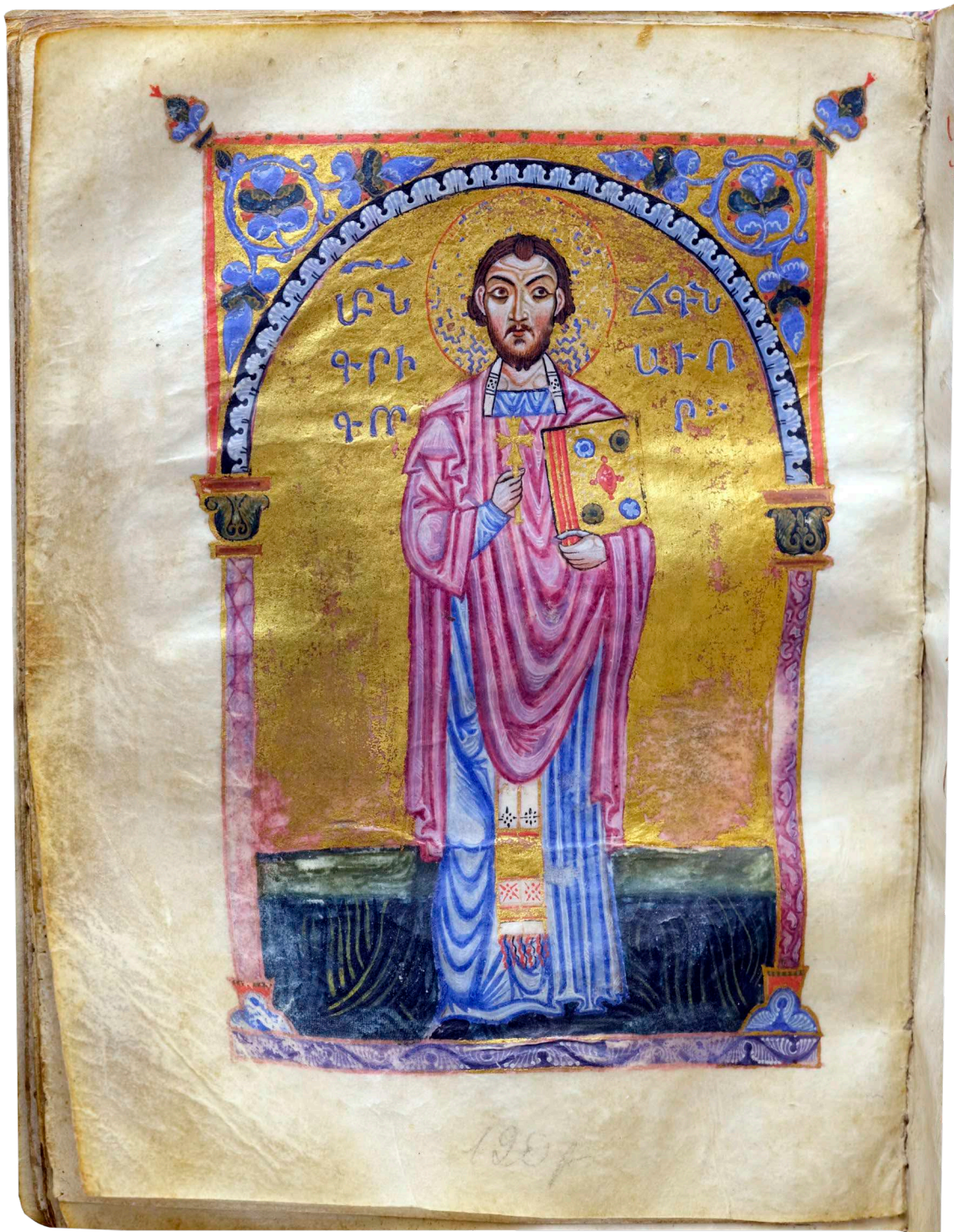
Figure 8: “Saint Grigor the Hermit” in Grigor Narekac’i’s Book of Lamentations , manuscript M1568, fol. 120v.