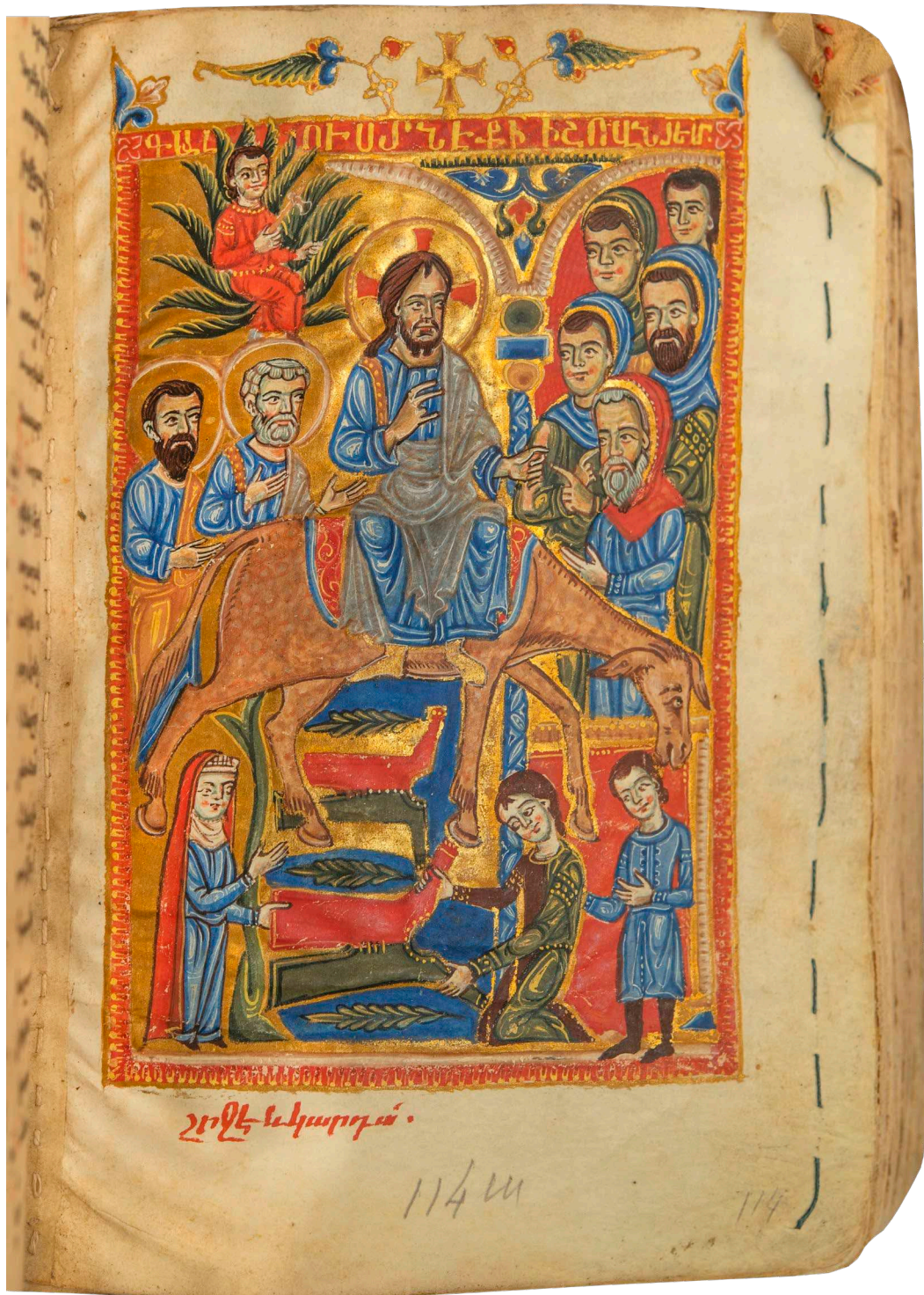
Figure 5: Gospel of Queen Mariun (1346 CE), Armenian Patriarchate of Jerusalem, manuscript J1973, fol. 114r.